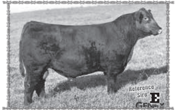
Reference Sire E