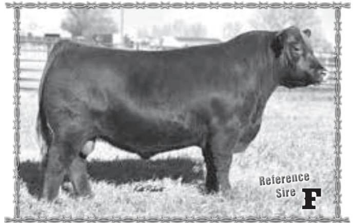
Reference Sire F