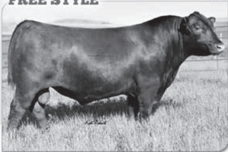
SUTH FREE STYLE 38G Born: 2/15/19 RAAA 4128342 1A Owned by: Sutherlin Farms LLC, MT, ABS Global, Inc., WI