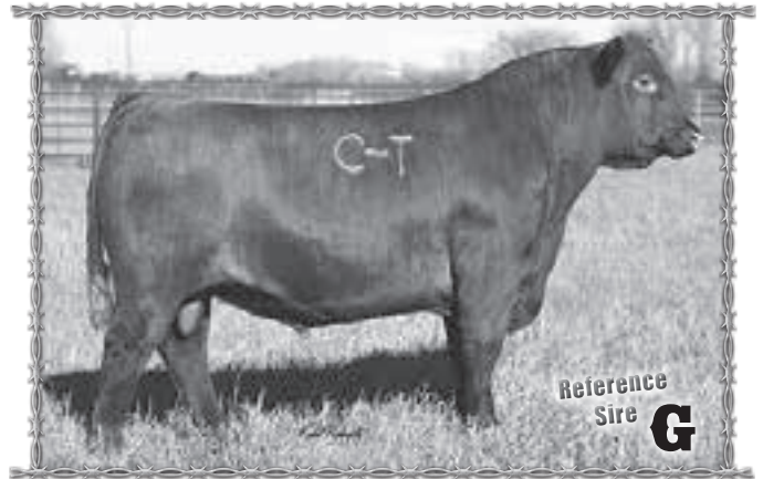
Reference Sire G