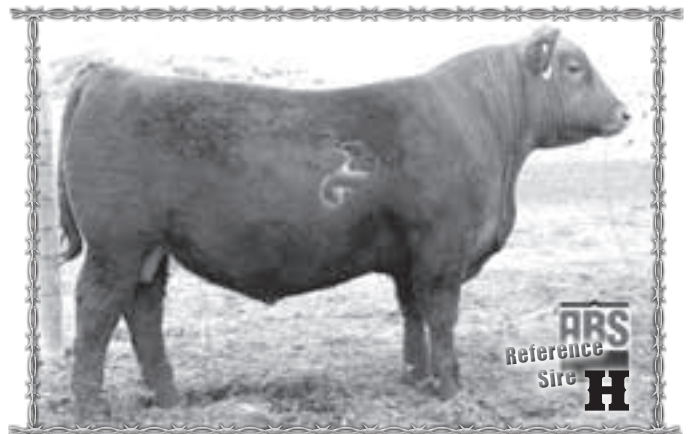
Reference Sire H