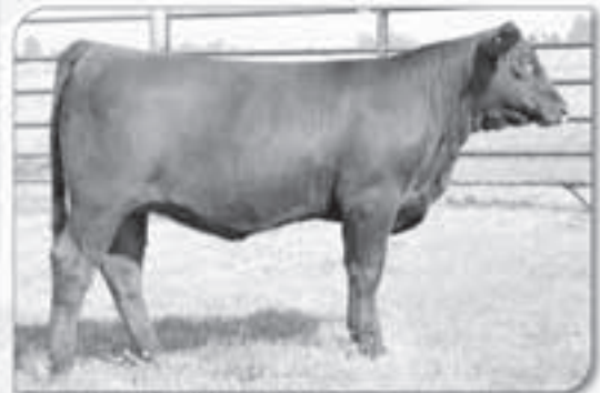
Daughter - SUTH Stormy Soja 21065, Sutherlin Farms LLC, MT

BEER HOLLA DEPTHE BEER DEEP END BOB BEER ALMA 188